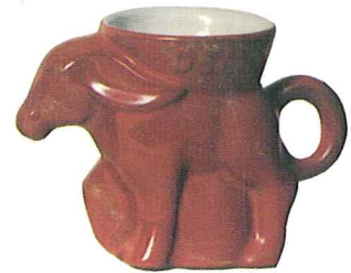
1984 DONKEY MUG $5.00

AVAILABLE IN 1984 COLOR: MULBERRY 5 OZ. COFFEE MUG