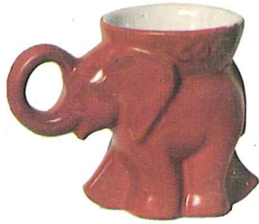
1984 ELEPHANT MUG $5.00

www.frankomacollector.com AVAILABLE IN 1984 COLOR: MULBERRY 5 OZ. COFFEE MUG